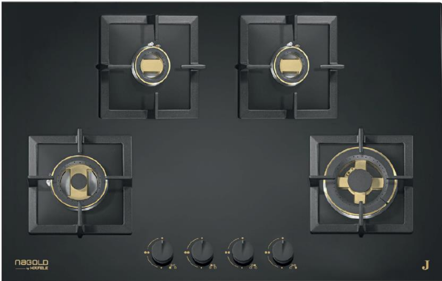
ORO 80-4 80cm 4 burner hob Article : 538.01.756