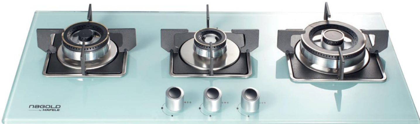
IVA 80-3 80cm 3 burner hob Article : 538.02.866